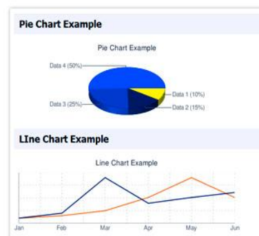
Figure 7. Arbitrary images

The visual images at hand are not only in the form of pictures or photos, but they include the moving images like films, movies, dramas and the like. Once, we understand the visual images clearly in terms of what they are, how they produce, how to create them, how to use them, what types of meaning are represented, and in what way the meanings are represented, it is not exaggerating that we may be included in the group of visually literate persons. At this stage, we might be able to use the skill in any purposes we involve like teaching English.