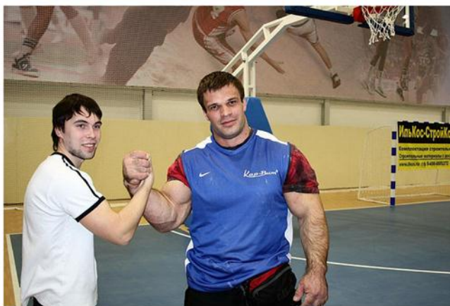
Figure 2. Regular guy vs. Russian arm wrestle Denis Cyplenkov

In terms of interpersonal/interactive meanings, visual images construct the interconnection features between speakers and listeners, writer and reader, and viewer and what is viewed. Figure 2 and 3 below denotes how the images demonstrate the interactive meaning between the viewer and what is viewed. In this case, the images share meaning to the viewers that Mr. Cyplenkov is powerful.