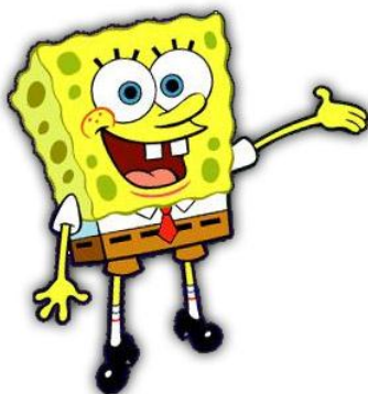
Figure 6. Analogical Images