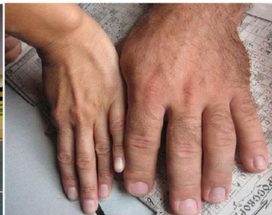
Figure 3. Female hand vs. Denis Cyplenkov's hand