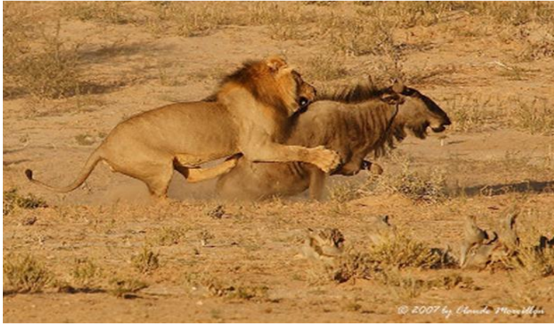
Figure 1. An actional image