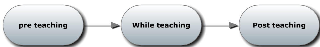
Figure 8. Basic lesson process

Basic aspects of English teaching learning process at least comprises three steps: pre-teaching, while teaching, and post teaching